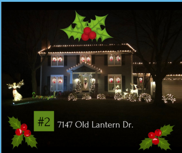
#2 7147 Old Lantern Dr.