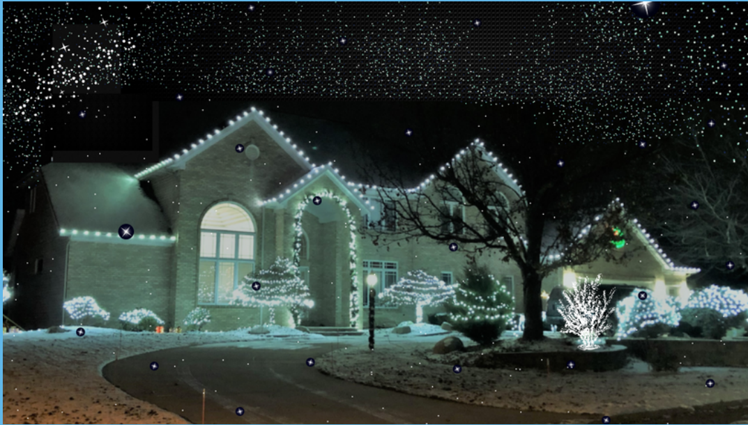
GRAND PRIZE WINNER - 1370 Kings Crossing