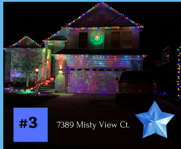
#3 7389 Misty View Ct.